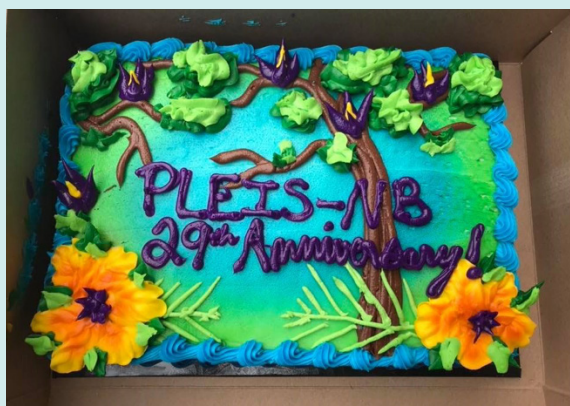
Thanks to Costco Wholesale and Sobeys Regent Street for contributing to our event.